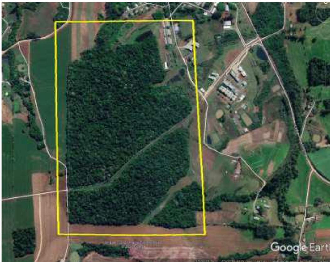
Figure 1. Location of the site of data acquisition. Based on Google Earth Pro scenes. The KML and KMZ are appended to the files.

The data were acquired from an aerial survey conducted with an Unmanned Aerial Vehicle (UAV, also Drone ) covering a forest area of the Federal University of Santa Maria – UFSM in the municipality of Frederico Westphalen, in the Rio Grande do Sul, Brazil (Figure 1). The climate of the region is subtropical (Cfa in the Köppen-Geiger classification) with an average annual temperature of 18 °C and annual precipitation of 1919 mm (Alvares et al., 2013). The rainfall is well distributed throughout the year.